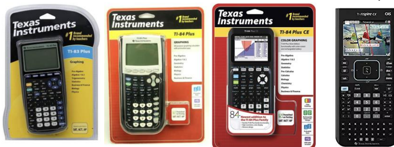
TI-83 Plus TI-84 Plus TI-84 Plus CE TI-Nspire

physical calculator to the exam, and sharing calculator is considered as cheating incident. Using the calculator apps on your phone is strictly prohibited on the exam. Do not purchase the TI-Nspire Graphing Calculator (around $150) because it is too advanced for this course. Instructions will not be provided for TI-Nspire.