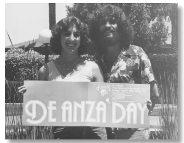
Two students hold up a promotional sign for De Anza Day in 1978.

De Anza Days began in 1971, only four short years after the college opened its doors to students, and would continue to be held on the first Sunday in June until the mid 1990s. It was called a "community recreation fair." The only cost to attendees was food and crafts – almost everything else was free. The only exception was a ride in a hot air balloon, which cost $5.