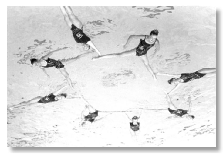
Synchronized swimming was a popular attraction at the pool.

In 1972, only the second year of the event, forty thousand people came to see water polo, fashion shows and Olympic diving competition at the pool. The fine arts were represented with weaving and needlepoint exhibitions, along with "glu-ins" for the