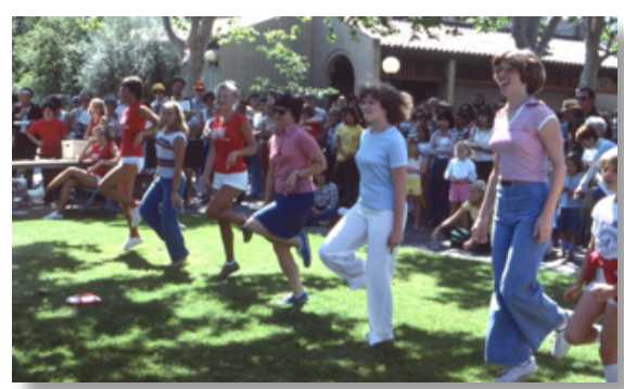
Young women competed in a contest to stand longest on one leg. The winner lasted over five hours!