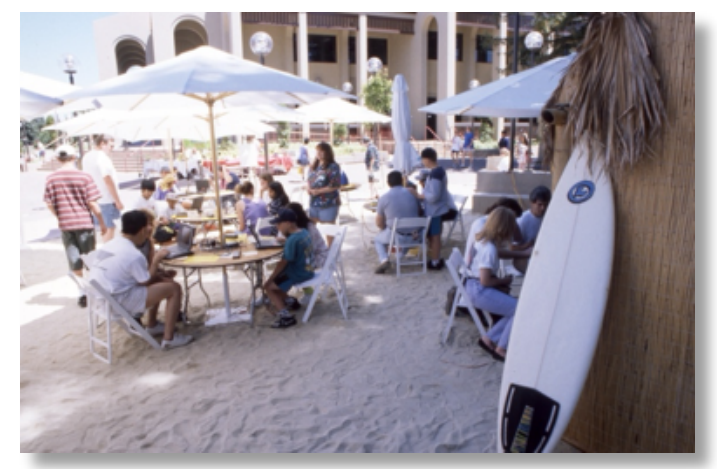
In the 90s, a beach was imported for use in front of the library.

The jumpers formed two-and-three-man star clusters and, jumping from over 5,000 feet, would then open their chutes with explosions of bright color while the audience cheered. The San Francisco Aquanuts performed their zany show at the pool, including acrobatic stunts while jumping, falling and diving off the diving boards. Gymnastic exhibitions were held in the nearby gym.