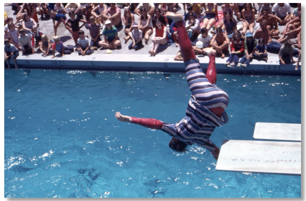
Not all the diving was picture perfect. Clowns performed some crazy, acrobatic dives that were just as difficult as the perfect ones.

After entertaining the public at De Anza Days for three decades, why did it not continue? Most of the campus staff that worked at the event were volunteers – those volunteers became much harder to come by as the years went on. And then there were the costs and the damages to the campus. In the 1970s over $4,000 was spent each year on extra security, extra custodial services and extra electricity needed to power all of the shows. While $4,000 seems low, even by 1970s standards, the cost was offset by funds collected from sponsors, artisans and food concessionaires who were selling their wares. The campus was built to handle up to 14,000 people at one time, but over 60,000 people showed up when the event was at its peak. Delivery trucks damaged lawns, shrubs and sprinkler heads and many vending machines were damaged due to vandalism. All of this was costly and was a distraction from the campus' primary mission education. So, sadly, we will not likely see De Anza Days again, but it sure looked like fun while it lasted!