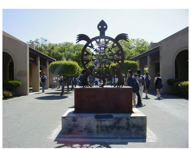
Do not post on or otherwise deface any artwork

Do not post on benches/seating areas (things can get torn off causing litter)