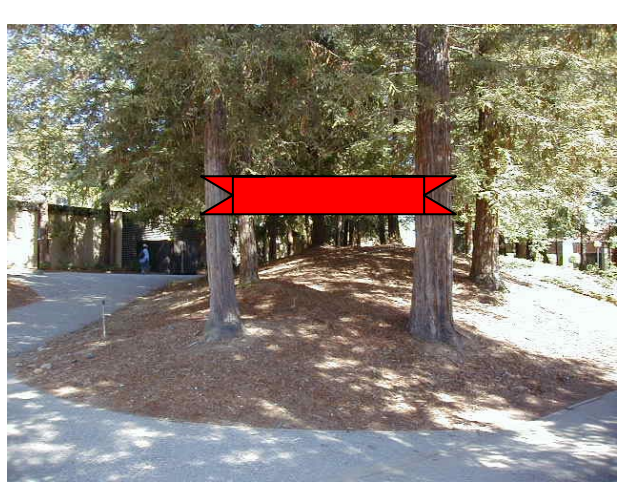
Do not cause damage to trees or other plants Suggestion: carefully tie signs, flyers, posters or banners to trees (but do not block paths)

Do not cause damage to trees or other plants Suggestion: Post signs, flyers, posters or banners on stakes that you drive into the ground