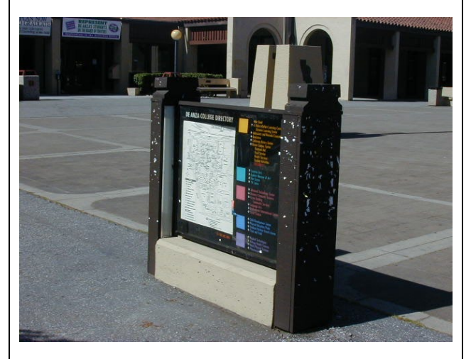
Do not cause damage to college property (See next picture)