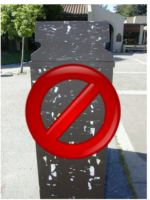
Do not cause damage to college property