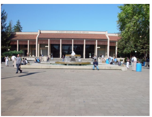
Do not post on benches/seating areas (things can get torn off causing litter)