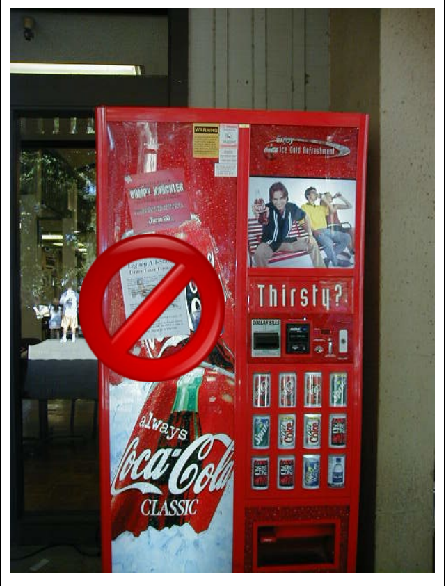
Do not post on vending machines