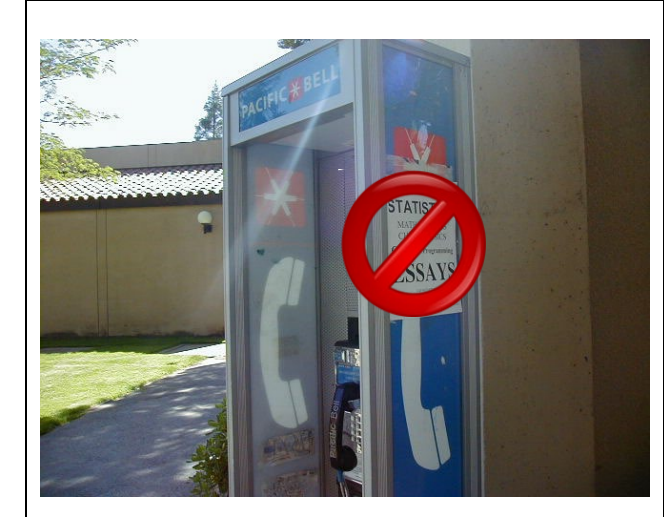
Do not post on phone booths