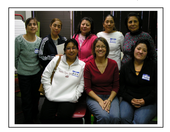
Participants in the Focus group conducted in November 2009